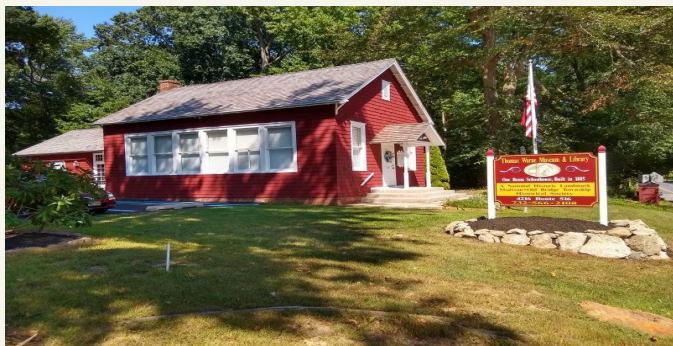
"The Little Red School House" across from Old Bridge Township High School Complex.

We welcome all questions and information pertaining to local family genealogy, township history, historic buildings and archeological findings. Community groups and school tours available by appointment.