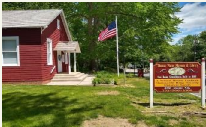
"The Little Red School House" across from Old Bridge Township High School Complex.

We welcome all questions and information pertaining to local family genealogy, township history, historic buildings and archaeological findings. Community groups and school tours