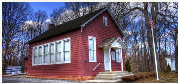
"The Little Red School House" across from Old Bridge Township High School Complex.

We welcome all questions and information pertaining to local family genealogy, township history, historic buildings and archeological findings. Community groups and school tours available by appointment.